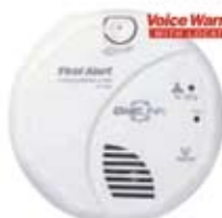
CO511B Battery Carbon Monoxide Alarm