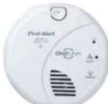
SA520B Bridge Unit-Wireless Hardwired Smoke Alarm

**Note: Based on average retrofitting costs of time, material and labor to connect to existing alarm circuit, drywall repairs, painting, etc. Special cases that require conduit, wire mold, concrete drilling, etc. would add additional costs and increase savings.