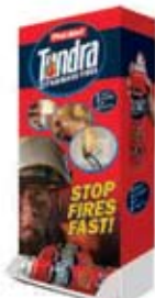
AF400-18WP Gravity Display Qty: 18