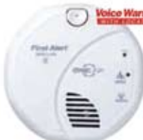
SA511B Battery Smoke Alarm