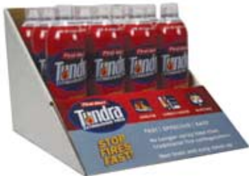
AF400-12SD Shelf Display Qty: 12