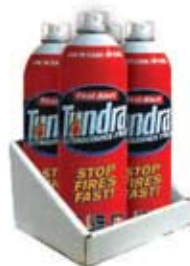
AF400 Tray Qty: 4